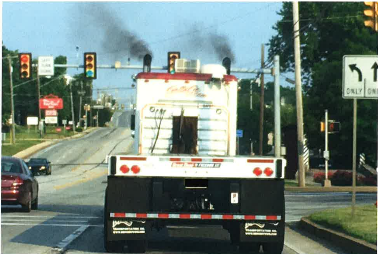
Diesel Pollution, June 14, 2017, Route 30, Lancaster, PA